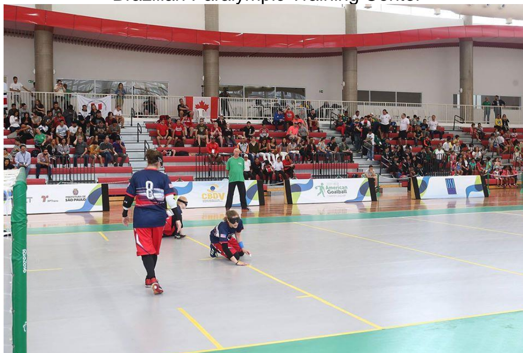
The same venues of the event held in 2017.